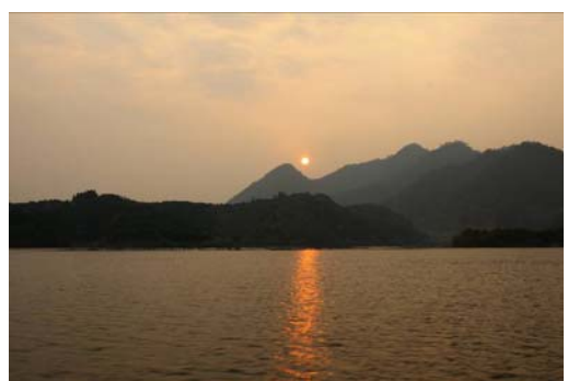
One-day sightseeing in Qiandao Lake (千岛湖)